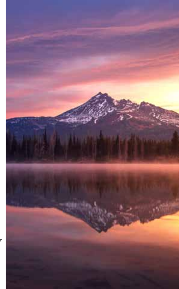
ZACK KENNEY With each election cycle, it is the dawn of new approaches, new angles, and new challenges to our environmental work.

It's time to shift from defense to offense – to put lines on the map and to strengthen the laws that protect our forests, rivers, and wildlife. We can't just hold the line any longer. Join us in creating a new natural legacy for the future.