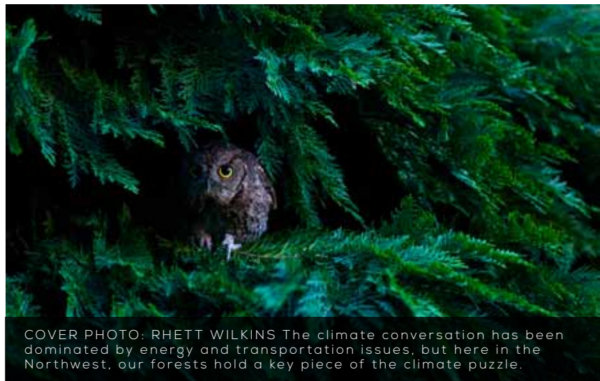
The climate conversation has been dominated by energy and transportation issues, but here in the Northwest, our forests hold a key piece of the climate puzzle.