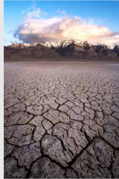
Clockwise from top left: WILDLANDS Alvord Desert