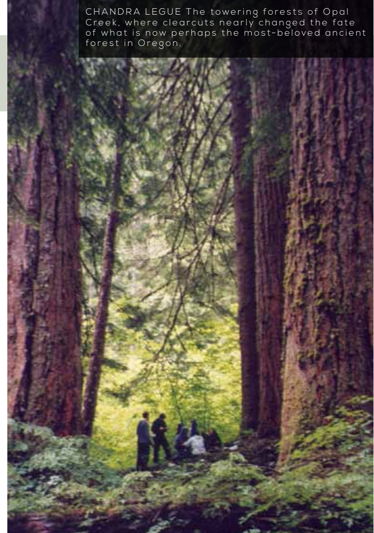
CHANDRA LEGUE The towering forests of Opal Creek, where clearcuts nearly changed the fate of what is now perhaps the most-beloved ancient forest in Oregon.

I urge you to keep these stories in mind as you read about the 10 Most Endangered Places in Oregon. It's a scary list. But our history should give you hope. For almost five decades, Oregon Wild has been turning impossible threats into improbable victories for public lands, wildlife, and free-flowing