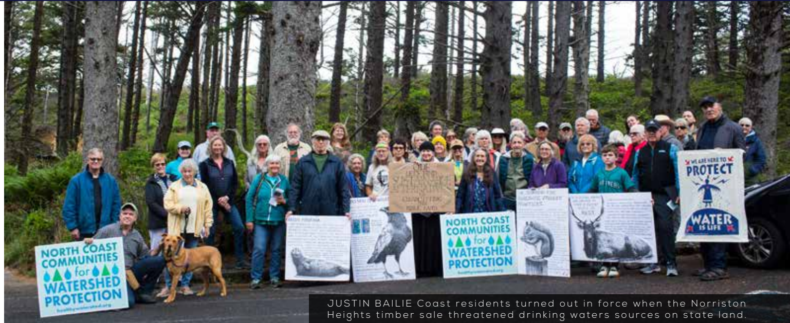
Coast residents turned out in force when the Norriston Heights timber sale threatened drinking waters sources on state land.