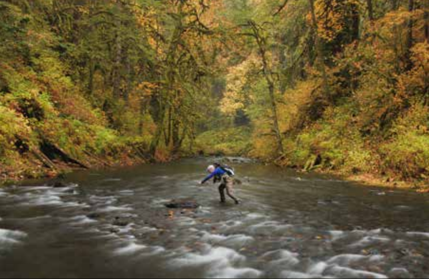
RHETT WILKINS Recreation values are a big part of how rivers and their tributaries can be protected. If you love recreating on rivers, nominate your favorite places to be protected in the Wild & Scenic Oregon bill.

identifies the “outstandingly remarkable values” that it seeks to protect. If the river flows through public lands, federal agencies must then develop management plans that ensure those values are protected. The more specific Congress is in identifying what values need to be safeguarded, the stronger the protection is. The more they leave it up to the Forest Service or BLM to decide, the weaker the conservation measures become. Wild & Scenic Rivers designation has little impact on rivers that flow through private lands.