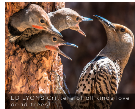
ED LYONS Critters of all kinds love dead trees!

So, love your forest, including the snags and fallen logs. And remember, every tree removed by logging is a tree that is denied the opportunity to fulfill its complete lifecycle. ☺