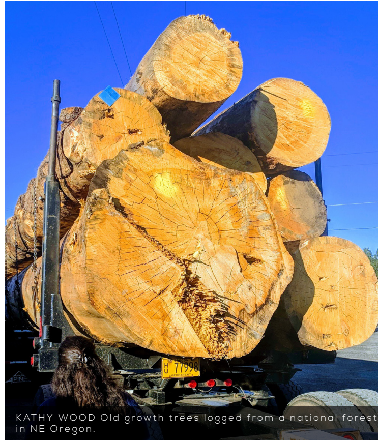
KATHY WOOD Old growth trees logged from a national forest in NE Oregon.

Rather than focus on places where agreement could be found, what I saw at that second stop on