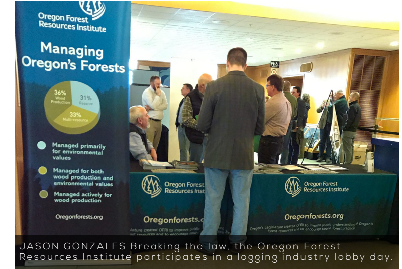
JASON GONZALES Breaking the law, the Oregon Forest Resources Institute participates in a logging industry lobby day.

The second investigation took on the Oregon Forest Resources Institute (OFRI), a quasi-government agency funded by tax dollars tasked with educating the public on Oregon's logging laws but forbidden from attempting to influence policy. Oregon Wild