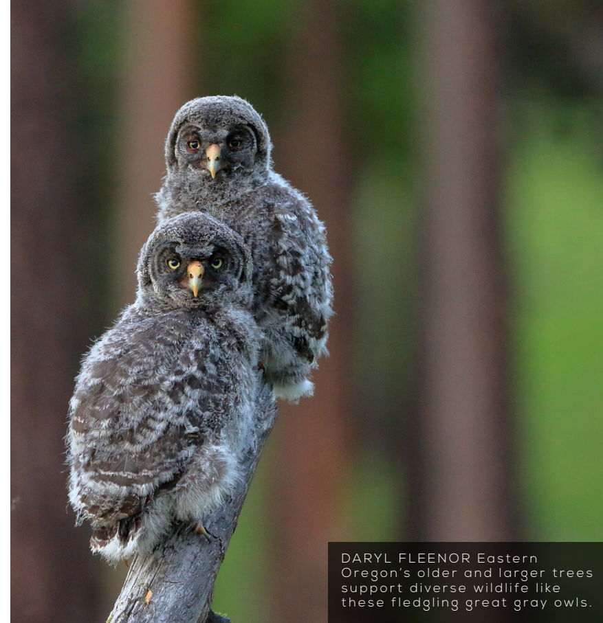
DARYL FLEENOR Eastern Oregon's older and larger trees support diverse wildlife like these fledgling great gray owls.

In that time, the screens have not just protected the biggest and oldest trees in eastern Oregon, but also wildlife habitat, clean cold water, and healthy soils. We're also increasingly recognizing the importance of large trees as carbon sinks working hard to mitigate the worst impacts of climate change.