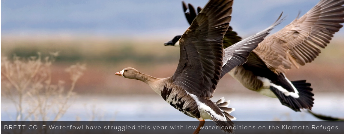
Waterfowl have struggled this year with low water conditions on the Klamath Refuges.

Oregon Wild has participated in collaborative groups around forests and public lands management all across Oregon. The idea behind these groups is to bring conservationists, timber interests, scientists, and others together to discuss problems, and to advise the Forest Service on how to solve them. Unfortunately, under the Trump administration, hostility towards science and conservation voices has deepened in some of these groups. In June, Oregon Wild and Greater Hells Canyon Council made the difficult decision to withdraw from the toxic Northern Blues Forest Collaborative. We welcome dialogue and honest disagreement about forest management, but we just can't lend credibility to groups that simply rubber stamp environmentally destructive logging. ☹