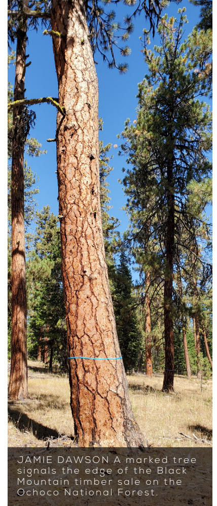
JAMIE DAWSON A marked tree signals the edge of the Black Mountain timber sale on the Ochoco National Forest.