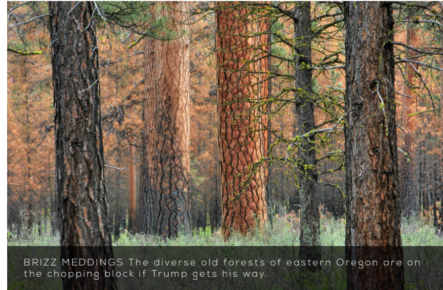
BRIZZ MEDDINGS The diverse old forests of eastern Oregon are on the chopping block if Trump gets his way.