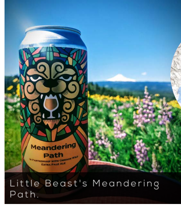
Little Beast's Meandering Path.

(pFriem), these beers showcased not only the creativity and talent of Oregon's brewing community but also their interconnectedness with Oregon's wildlands and rivers.