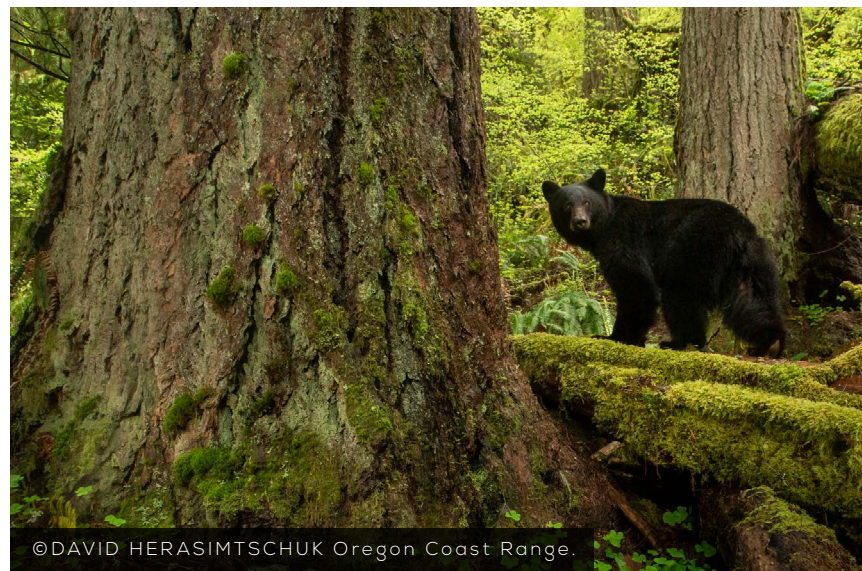
Oregon Coast Range.