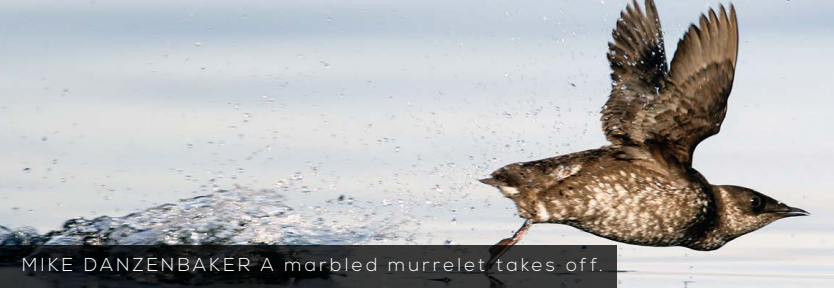
A marbled murrelet takes off.

only increased by three wolves, from 175 to 178, last year. Meanwhile, 17 of the 20 known wolf mortalities were caused by humans: half were killed illegally by poachers, and the other half rubber-stamped by ODFW.