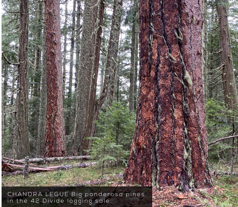
Big ponderosa pines in the 42 Divide logging sale.

Oregon Wild remains deeply committed to securing lasting protections for our climate forests. Stay tuned for updates and information on ways you can share your own voice with the Bureau of Land Management and the Forest Service throughout the agencies' rulemaking processes. ☺