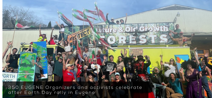
350 EUGENE Organizers and activists celebrate after Earth Day rally in Eugene

rallies planned across the country. Hundreds of activists marched through the streets of Eugene and took the stage at the Saturday Market to perform a flash mob that called out the egregious mature and old-growth logging taking place in our public forests. They asked the crowd to envision a future where these forests are protected and allowed to grow into the next generation of old-growth.