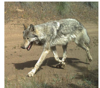
A Metolius wolf in Jefferson County.

When it comes to a species that is highly poached, unfortunately, wolves are at the top of that list. The 2022 annual wolf report, which came out earlier this spring, underscores the profound effect human-caused mortality (legal and illegal) is having on the species' ability to recover. For example, the minimum wolf count