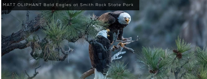
MATT OLIPHANT Bald Eagles at Smith Rock State Park

Moving forward, wildlife conservation groups will actively monitor the implementation of these recovery plans to watchdog their effectiveness, provide feedback for improvements and ultimately, make sure Oregon is doing everything it can to restore marbled murrelet populations and habitat. ©